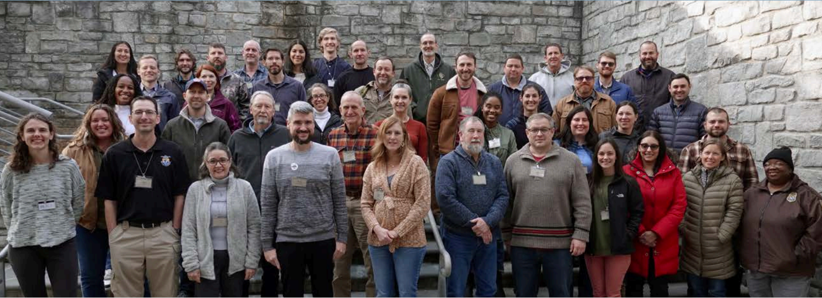
Above: CCITT Workshop participants at NCTC January 2023

One of the most effective ways for CCITT to raise awareness, educate, network, and advance its mission is through presentations and workshops. CCITT members provided talks at a number of conferences in 2023. Additionally, CCITT teamed with Foundations of Success to facilitate a workshop with over 40 stakeholders from across the United States and Canada. This multidisciplinary cohort of professionals met at the National Conservation Training Center in Shepherdstown, West Virginia, to strategize on how best to address the problem of illegal turtle trade - work that has been critical towards the development of the CCITT Strategic Plan. Below is a brief summary of CCITT presentations and events from 2023.